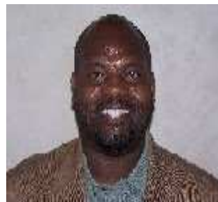
BIG BROTHERS BIG SISTERS AT WORK